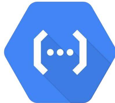
Google Cloud Functions